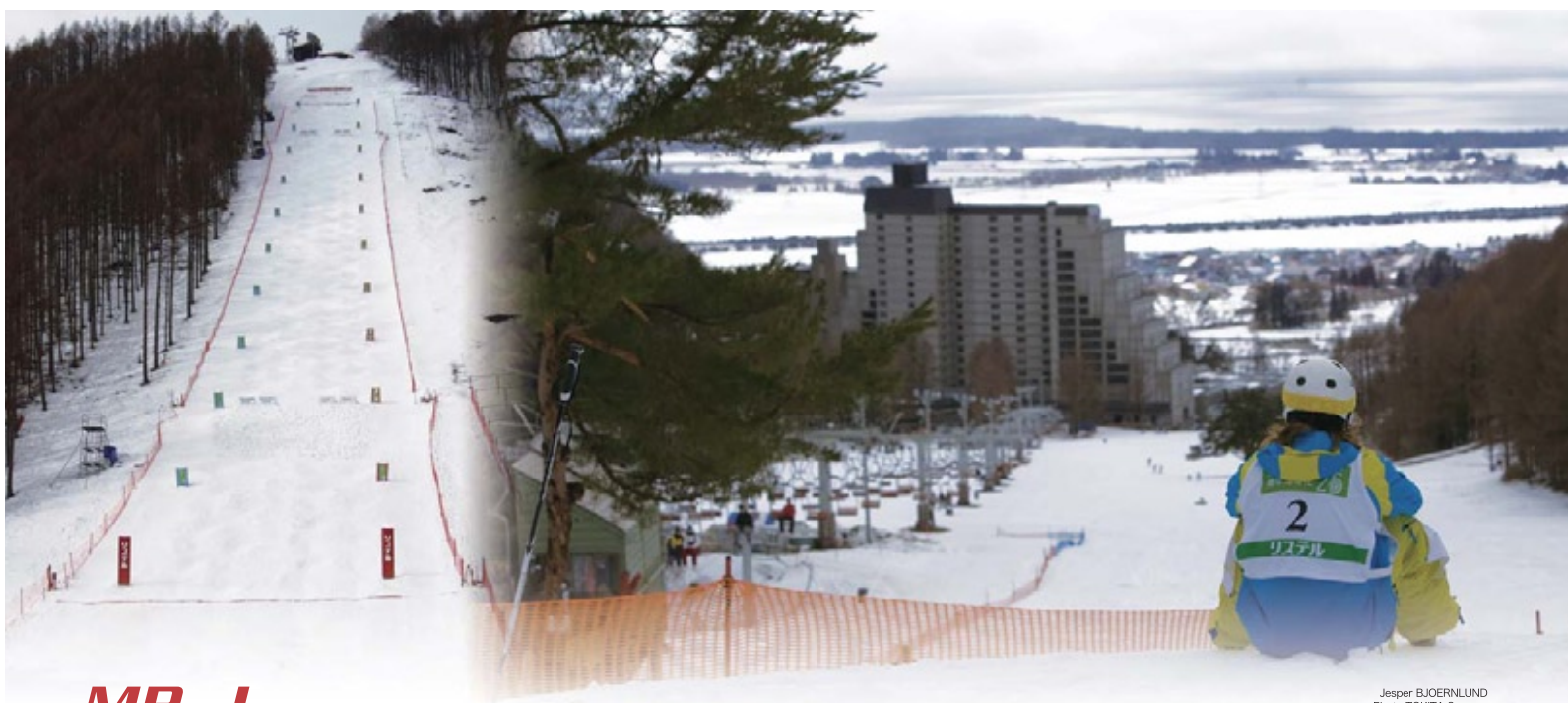
Jesper BJOERNLUND